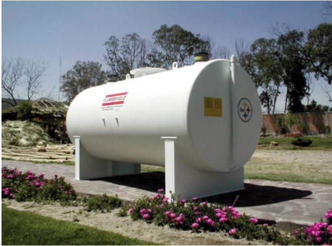
2-Hour 2000° Fire-Tested Performance

FLAMESHIELD® aboveground storage tanks are manufactured with a tight-wrap double-wall design. Standard features include 2-hour fire-tested performance, built-in secondary containment and interstitial monitoring capability.