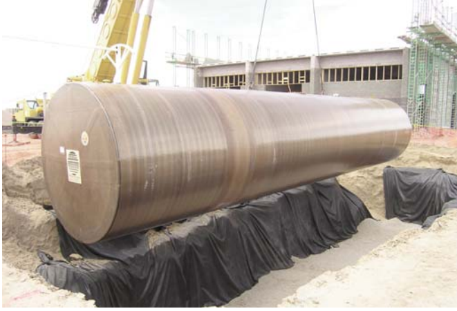
Meets EPA Leak Detection Requirements for Underground Storage Tanks

PERMATANK® double-wall jacketed underground storage tank features an inner steel tank coupled with an exterior corrosion-resistant fiberglass tank. A unique standoff material separating the inner and outer tanks creates a uniform interstitial space ensuring rapid and accurate leak detection.